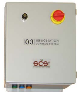
Satellite Controller @ Each Room

All installations can be custom-programmed per the customer needs and wants.