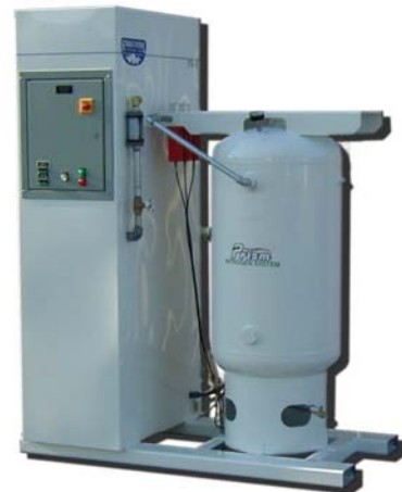
T5-2 (External Compressor Not Shown)

Storage Control Systems, Inc. custom builds nitrogen generator systems using membrane separators manufactured by PERMEA, the industry leader of CA technology.