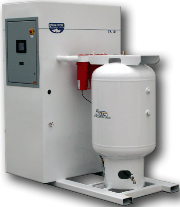
Model T8-12 (External Compressor Not Shown)