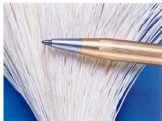
THOUSANDS OF MEMBRANE FIBERS ARE CONTAINED IN THE COMPACT PRISM ALPHA MEMBRANE SEPARATOR.