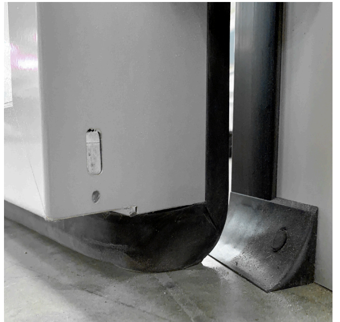
Sliding Example Chilltight Door Seal at Corner

© 2022 STORAGE CONTROL SYSTEMS, LTD. ALL RIGHTS RESERVED. CONTACT US FOR MORE INFORMATION.