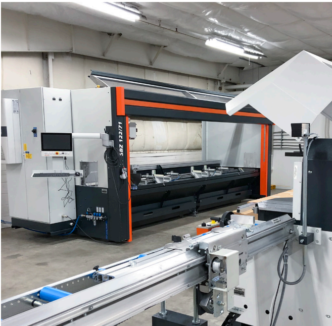
Chilltight Door Manufacturing at SCS Headquarters in Michigan