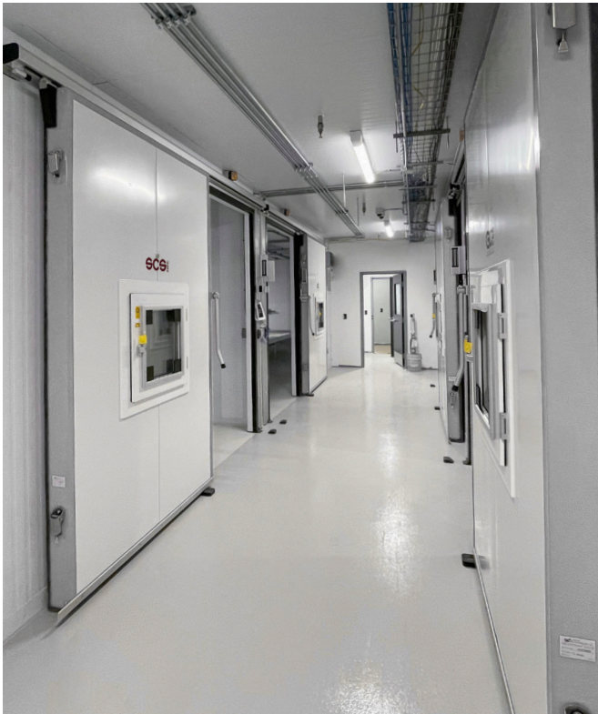
Sliding SCS Chilltight Doors in Facility Hallway