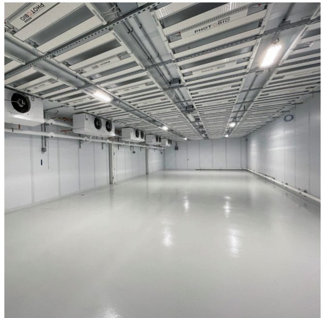
Grow Room Fit-Out by GC with GC IMP & Dehu using Reheat Coils

The SCS-20 Mesh LED Light Controller connects to a Bluetooth® mesh network and controls a group of lights using a 0-10V dimming and a relay output. Day/Night Times are programmable through the SCS-20 Mesh, as well.